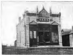
WINNEBAGO COUNTY BANK, FOREST CITY, DECEMBER, 1880

Building opposite team and buggy, occupied by First National Bank, 1876-1883.